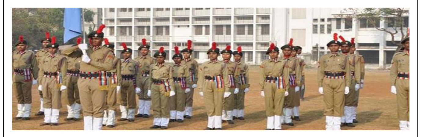
Republic Day Celebrations at ABMRCP

On Sunday, January 26<sup>th</sup>, 2018 our society has continued with its celebrations and cultural programs. Our esteemed guests, who have been invited on this occasion will be able to watch the 69th Republic Day ceremonies being held at Red Fort. The 69th Republic Day will be observed on January 26, 2018 at 7pm. A series of cultural programmes will be presented by students and teachers from on 69th Indian Republic Day today. The programme which began at 10:00 am will continue until 5:00 pm, where students from across the country will perform diverse dance and music forms in keeping with themes of Republic Day 2018. On 69th Republic Day Celebration, we invite you to attend a cultural program on Republic Day. The 69th Republic Day Celebration of India is scheduled to be held on January 26, 2018. The ceremony will be performed by President Pranab Mukherjee who will address the nation over the national television. The theme of this year's Republic Day celebration is "Know Our Heritage".