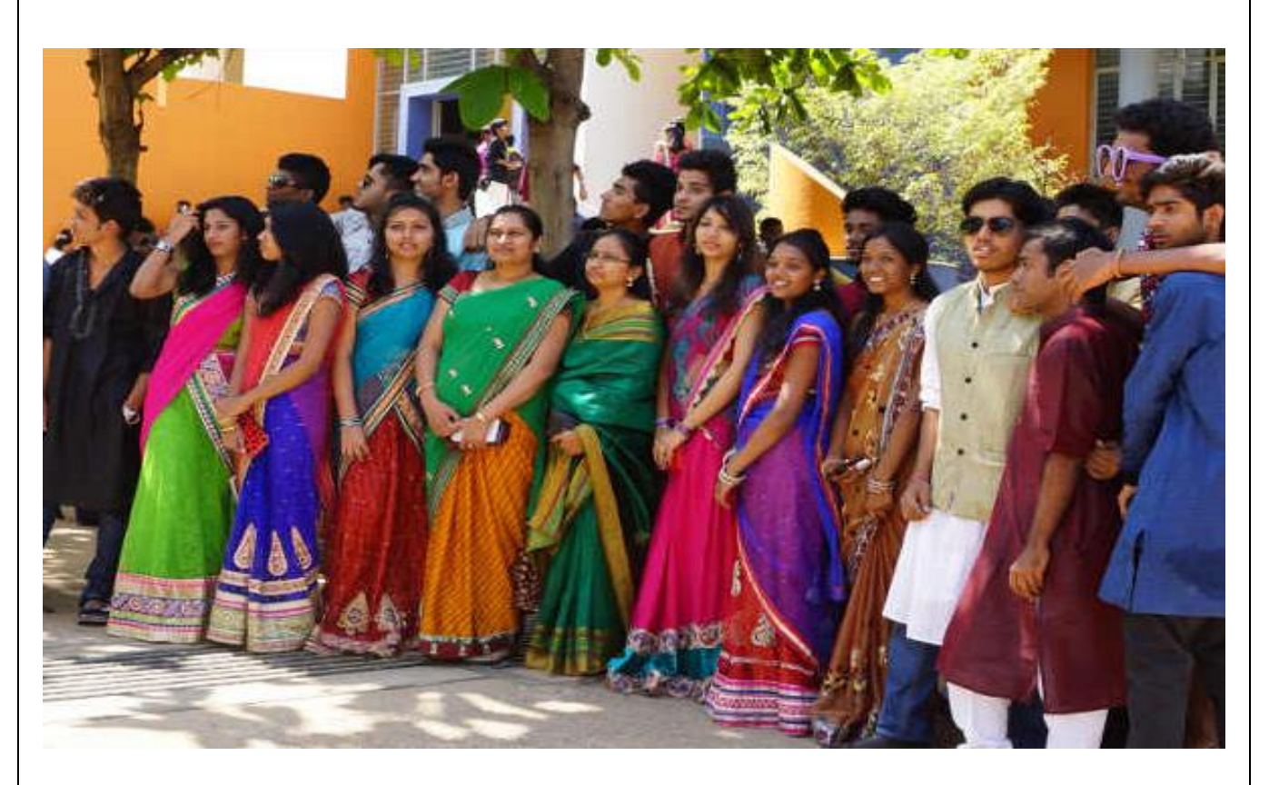
Ethnic Day Celebrations at ABMRCP

This event was celebrated om 19<sup>th</sup> March 2018. World Ethnic Day is marked on to celebrate different cultures and ethnic communities. The special day helps people to reconnect with their traditional and cultural roots. It also reminds people of the true essence of age-old customs which have helped shape civilizations around the world. Ethnic day is a day of celebration for the diversity of cultures and ethnicities. It enables the young generation to revive love and respect for their own culture and history. On this significant day, people wear ethnic clothes (like saree and kurta-pyjama in India) to draw attention to the beauty of traditional dresses and accessories. In the era of the internet and social media, it's easy to connect with people and get information about their cultural traditions. People also organise cultural events to make others aware of their age-old traditions and cultural practices.