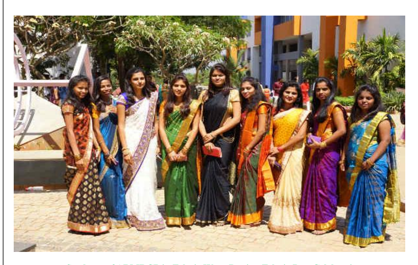
Students of ABMRCP in Ethnic Wear During Ethnic Day Celebration

This event was celebrated on 19<sup>th</sup> March 2019. World Ethnic Day is marked on to celebrate different cultures and ethnic communities. The special day helps people to reconnect with their traditional and cultural roots. It also reminds people of the true essence of age-old customs which have helped shape civilizations around the world. Ethnic day is a day of celebration for the diversity of cultures and ethnicities. It enables the young generation to revive love and respect for their own culture and history. On this significant day, people wear ethnic clothes (like saree and kurta-pyjama in India) to draw attention to the beauty of traditional dresses and accessories.