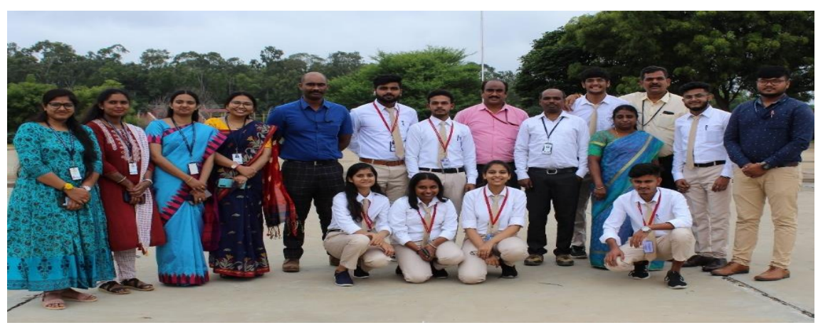
Students and Staff of ABMRCP Celebrating Indian Republic Day