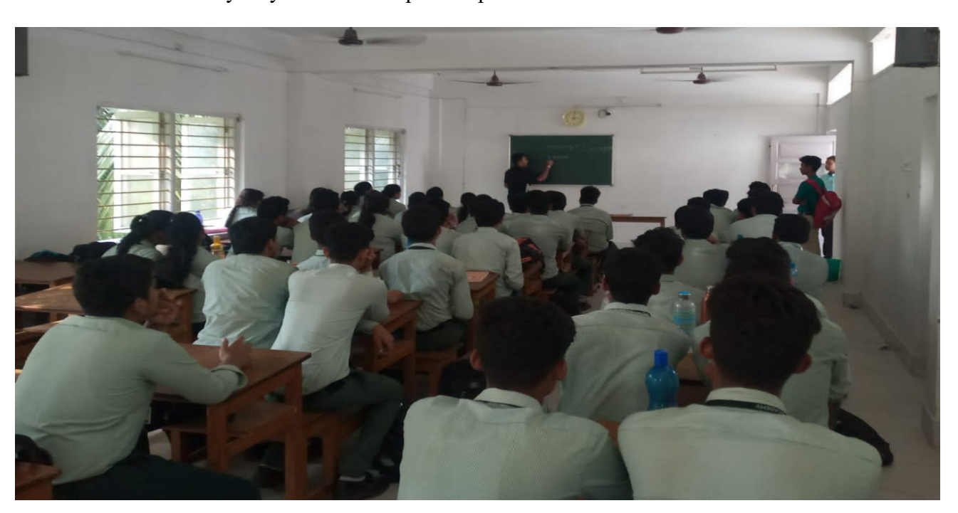
Students of ABMRCP Participating in World Literacy Day

International Literacy Day celebrations have taken place annually around the world to remind the public of the importance of literacy as a matter of dignity. As the theme for this year's International Literacy Day (ILD) is Every Child, Every Moment, literacy experts have asked the public to help promote literacy in all its forms. International Literacy Day is a global celebration of the importance of literacy and encourages everyone to promote it. International Literacy Day is a global literacy awareness campaign, which was celebrated on 8<sup>th</sup> September 2017. This day was started in 2005 under the auspices of UNESCO – the United Nations Educational Scientific and Cultural Organization, who is committed to improving access to education for all members of the world's population. On International Literacy Day, we will celebrate and support important programs that promote literacy, including the annual World Book Night by purchasing books at all participating bookstores. The theme of International Literacy Day 2019 is "Keep it Simple".