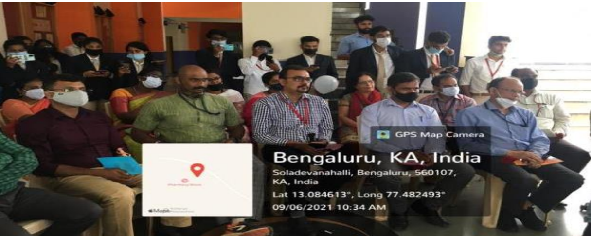
Staff and Students of ABMRCP at Teachers Day Celebration