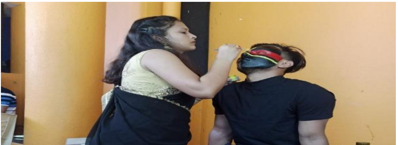
Students Participating in Talent Star Hunt