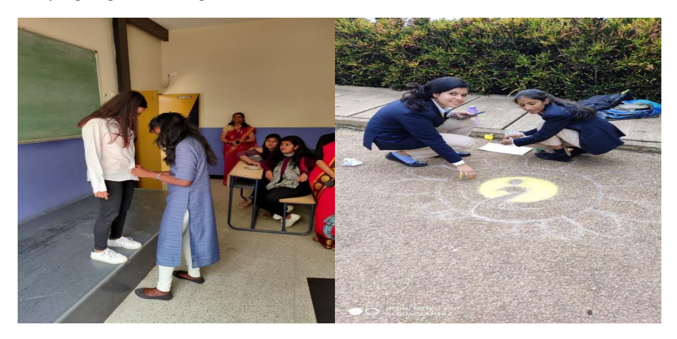
Students Competeing in Programs on International Women's Day

Women are a valuable part of society, they are the key to preserve the human race and in today's world, the importance of women in society is beyond any suspicion. International Women's Day (March 8) is a global day celebrating the historical, cultural, and political achievements of women. The day also observed in support of taking action against gender inequality around the world.. Women's Cell, ABMRCP celebrated the IWD 2022 on a large scale with various activities for all the students and women employees. This event was celebrated on 5<sup>th</sup> March 2021. The events included off and on-stage events. On-stage events were Dancing, Singing, Musical chairs, Games – whispering, bottle flip, thread and needle, tongue twister and Ramp walk. Off stage events conducted were Treasure hunt, Mehendi, Hairstyling, Vegetable carving