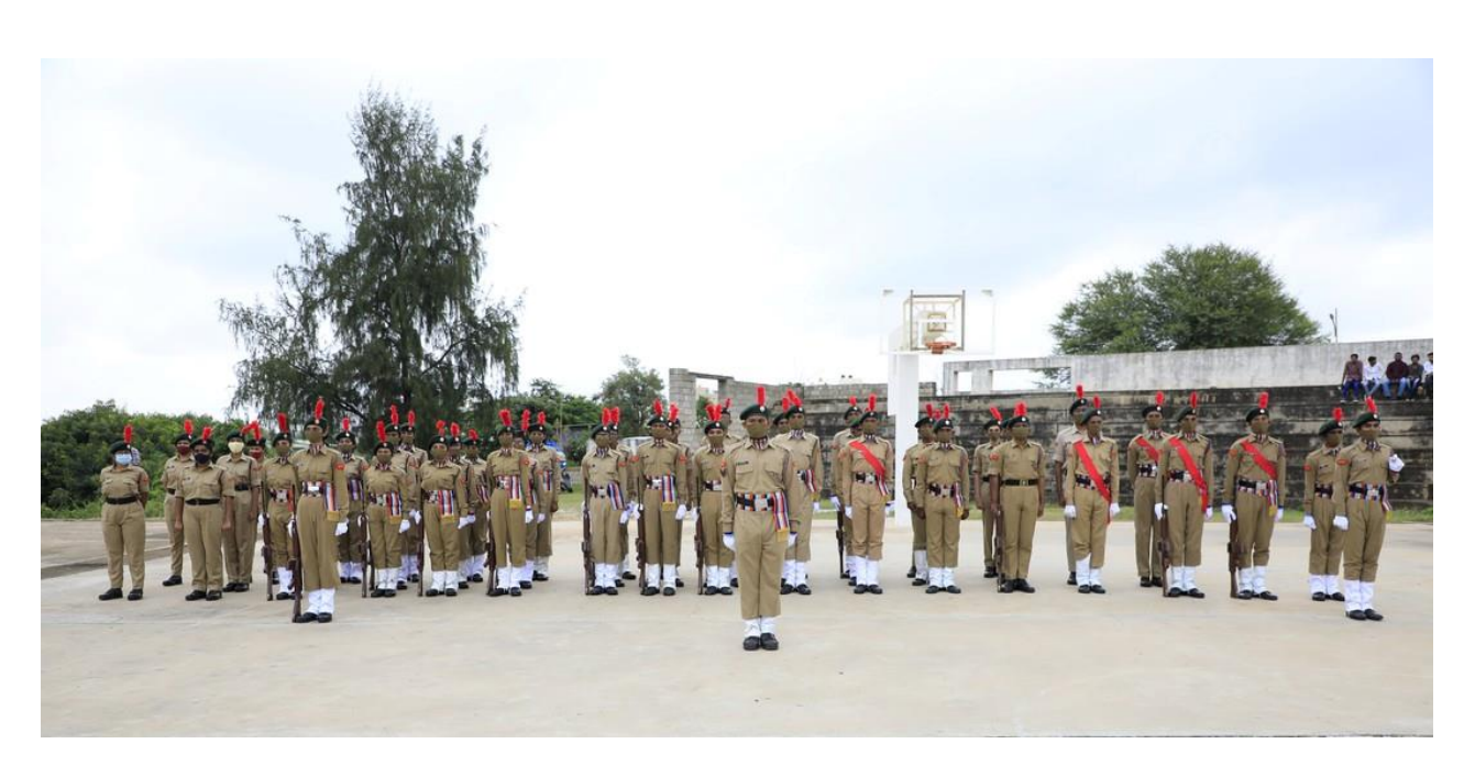
Students of ABMRCP Marching on 73<sup>rd</sup> Independence Day

On 15th August 2019, India celebrates 70 years of its independence from the British Raj with festivities across the country. The Indian Independence Day 2019 will be celebrated for 72nd time in a row. The Indian Independence Day 2019 was celebrated on August 15th. It is a national holiday in India and across the world. The celebration and holiday marks the day when their nation gained independence from the British and kick-started their new life with its own constitution, laws and ideals. Independence Day 2019 is a public holiday in India, celebrated on 15th Aug. It's one of the biggest festivals in Indian history where people gather to show their love and respect for the country. Independence Day [India] is celebrated every year on 15th August to commemorate the adoption of the Indian Constitution by India on this day. On this special day, Indian people show their national spirit and respect towards each other as well as countrymen by holding various cultural events, sports activities, and other social activities across the country. Indian Independence Day 2019 is celebrated on 15th august.