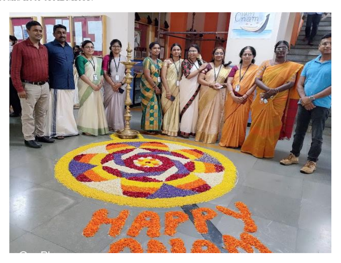
Staff of ABMRCP at Onam Celebrations in the Campus

Onam is reminiscent of Kerala's agrarian past, and is considered to be a harvest festival. Onam is celebrated to mark the homecoming of the King Mahabali who is believed to be the greatest king ever in Kerala. The preparations of onam celebration was started from evening of 6th September with students gathering together for drawing the layout of pookkalam (flower carpet) and preparing different colors of flowers by removing petals to be used on next day. Traditional decorations were also arranged by the students as part of the festival. Onam was celebrated in a grand and traditional manner. On early morning of 7th of September 2019, students gathered and prepared the pookkalam in the corridor on the ground floor of ABMRCP.