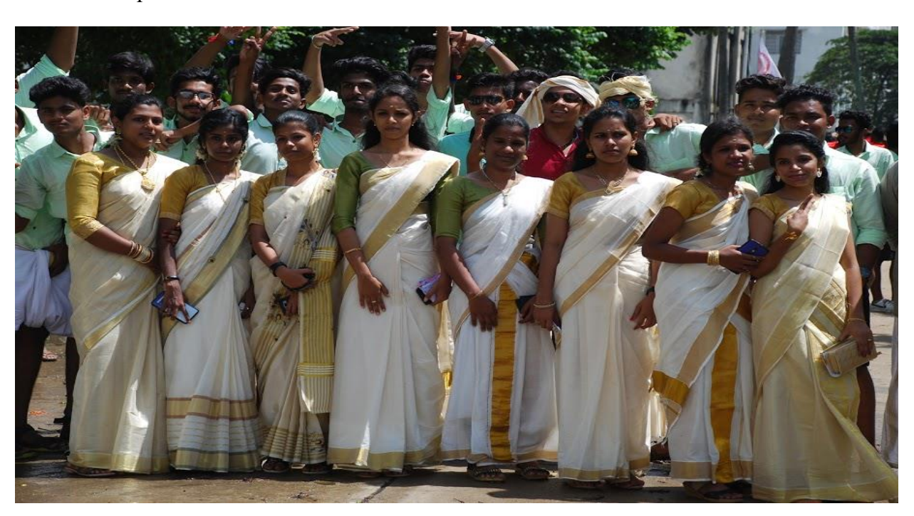
Students Celebrating Onam in Achraya Campus

Onam is celebrated on 10<sup>th</sup> September 2017. Onam is reminiscent of Kerala's agrarian past, and is a harvest festival. Onam is celebrated to mark the homecoming of the King Mahabali who is believed to be the greatest king ever in Kerala. The preparation of Onam celebration was started from evening of 6th September with students gathering together for drawing the layout of Pook kalam (flower carpet) and preparing different colours of flowers by removing petals to be used on next day. Traditional decorations were also arranged by the students as part of the festival. Onam was celebrated in a grand and traditional manner. On early morning of 10th of September 2019, students gathered and prepared the Pook kalam in the corridor on the ground floor of ABMRCP. Female Staffs and students came in their traditional sarees and young men resplendent in their colourful choices of dhothis. The keralites students delivered the message on Onam and narrated the story of Mahabali (the benevolent and generous king who ruled his kingdom without discrimination) along with visual demo of the story, followed by a procession leading to the volleyball court where various events and competitions were conducted. competition etc were conducted.