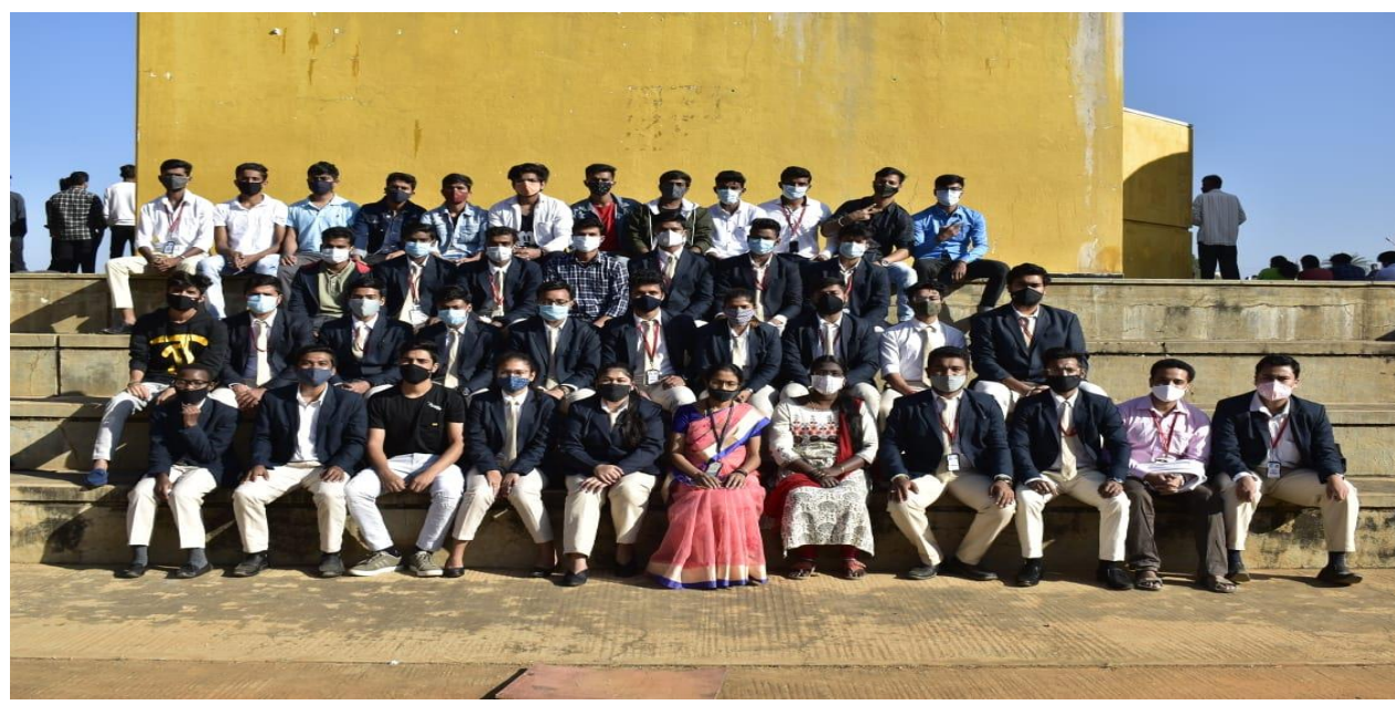
Students and Staff at 75th Independence Day Celebrations