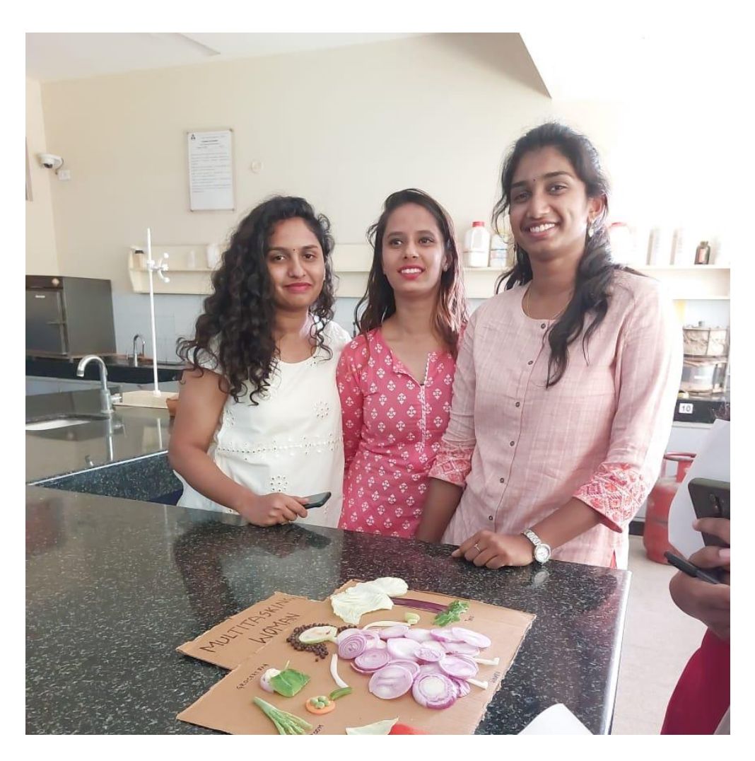
Cook without Fire Competition: International Women's Day

Women's Cell, ABMRCP celebrated the IWD 2020 on a large scale with various activities for all the students and women employees. The events were organized on the 8<sup>th</sup> of March 2019 due to other preoccupations scheduled for the 8 of March. On Stage events and off stage events were conducted from 10 am till 4:30 pm. On-stage events were Dancing. Singing. Musical chairs. Games - whispering, bottle flip, thread and needle, tongue twister and Ramp walk. Off stage events conducted were Treasure hunt, Mehendi, Hairstyling. Vegetable carving. For the women house-keeping staff games were conducted musical chairs, bucket ball, blindfold and ek minute.