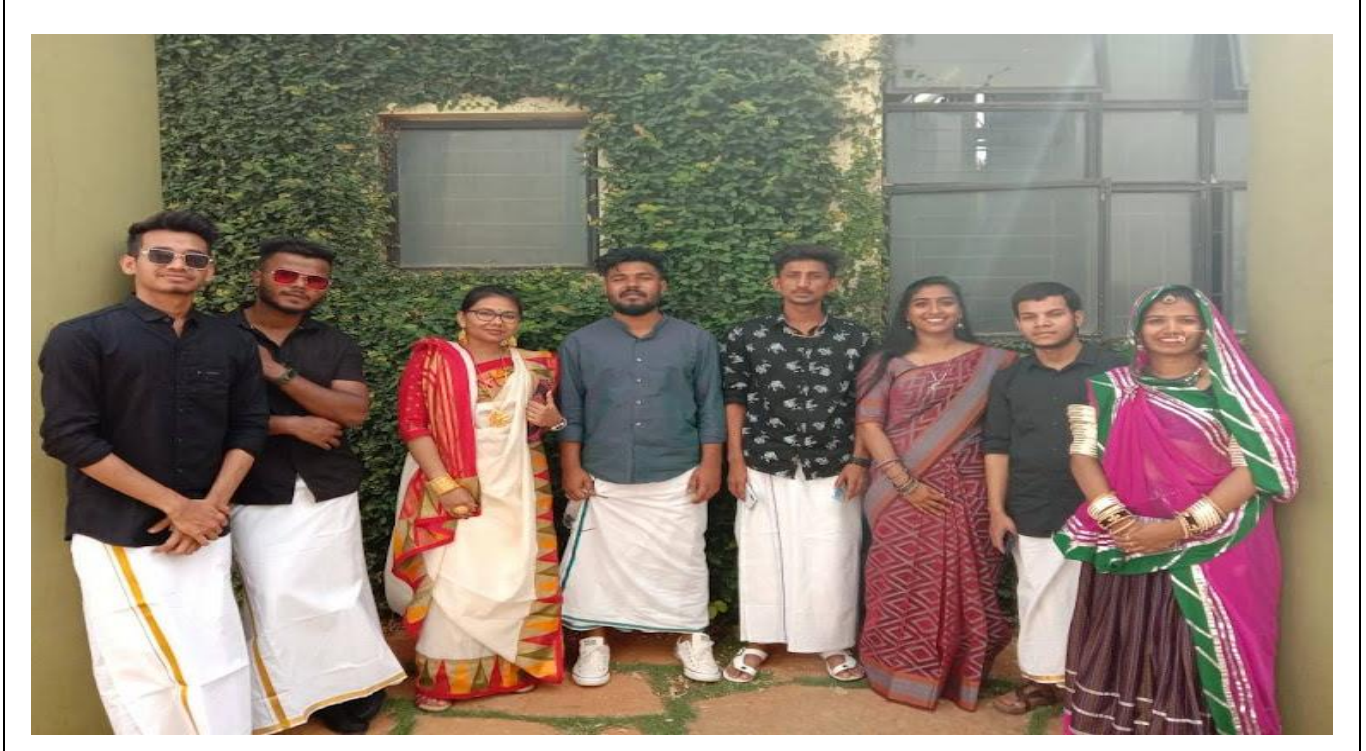
Staff and Students of ABMRCP participating in Ethnic Day

World Ethnic Day is marked on 19 June to celebrate different cultures and ethnic communities. The special day helps people to reconnect with their traditional and cultural roots. It also reminds people of the true essence of age-old customs which have helped shape civilizations around the world. Ethnic day is a day of celebration for the diversity of cultures and ethnicities. The day is also celebrated by exchanging handicrafts, sweets, and musical instruments among family and friends. Cultural events, traditional food, and music exploring traditional themes, and rediscovering India in a uniquely different way are some of the highlights of this day. Every year during the various celebrations of acharya Habba ETHNIC DAY is celebrated and Let Colours of the Diversity flow through the lanes of Acharya. The event also saw the participation of many international students studying in the college and the regional games like Kunte Bille, buguri, goli and so on were included in the festive celebration.