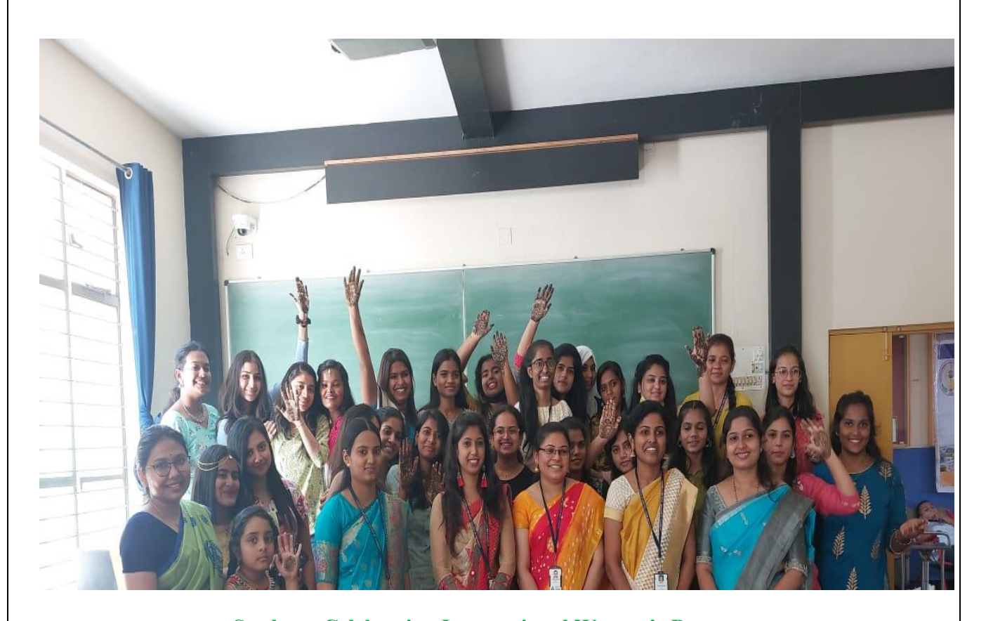
Students Celebrating International Women's Day

Women's Cell, ABMRCP celebrated the IWD 2020 on a large scale with various activities for all the students and women employees. The events were organized on the 7<sup>th</sup> of March 2020 due to other preoccupations scheduled for the 8 of March. On Stage events and off stage events were conducted from 10 am till 4:30 pm. On-stage events were Dancing. Singing. Musical chairs. Games - whispering, bottle flip, thread and needle, tongue twister and Ramp walk. Off stage events conducted were Treasure hunt, Mehendi, Hairstyling. Vegetable carving. For the women house-keeping staff games were conducted musical chairs, bucket ball, blindfold and ek minute.