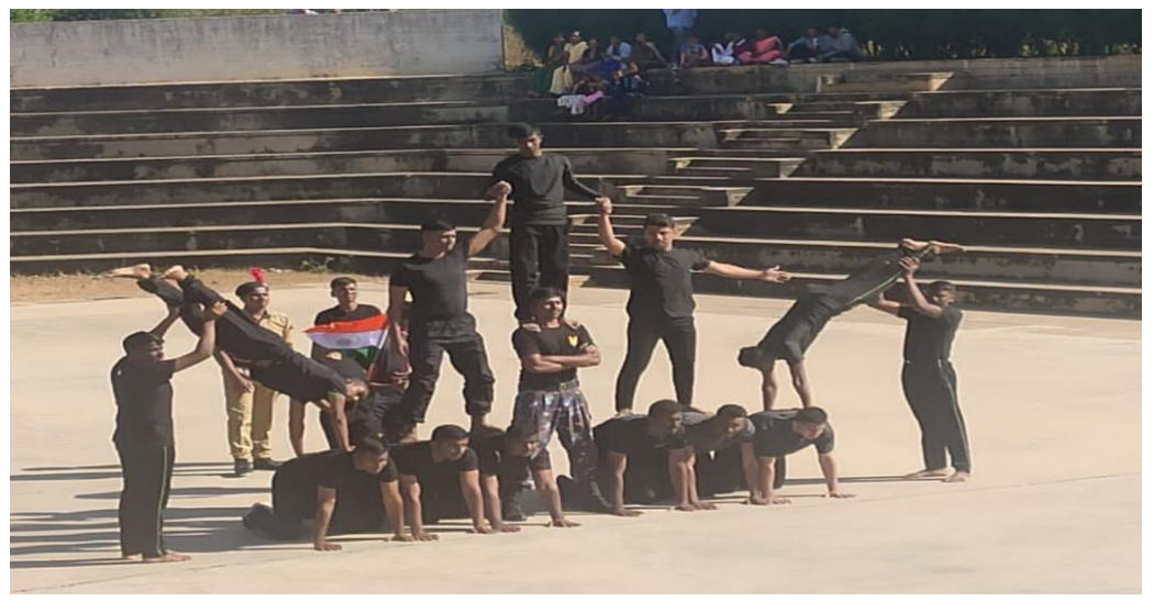
Students Participating in National Republic Day