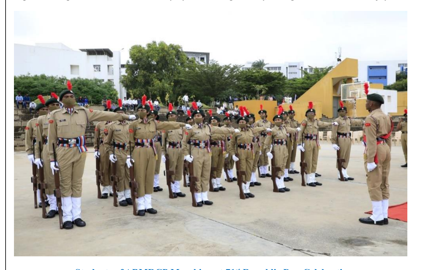
Students of ABMRCP Marching at 71st Republic Day Celebrations

The day started with a cultural programme whereby many indigenous dance forms were presented. Celebrate 71st Republic Day by watching the best performances and performances. On August 15, 1947, India attained its freedom from the British with a stunning victory for the Indian National Congress and Mahatama Gandhi. A year later, in 1949, India became a republic. The Government of India has organized Cultural Program on 71st Indian Republic Day Ceremony. The program will include cultural programs like LIVE music concert by ARMY OF LIGHTS and dance performances. Indian Republic Day 2020 is being celebrated on 26th January and the cultural. The people of India express their patriotism for their country by celebrating this day with great enthusiasm and joy.