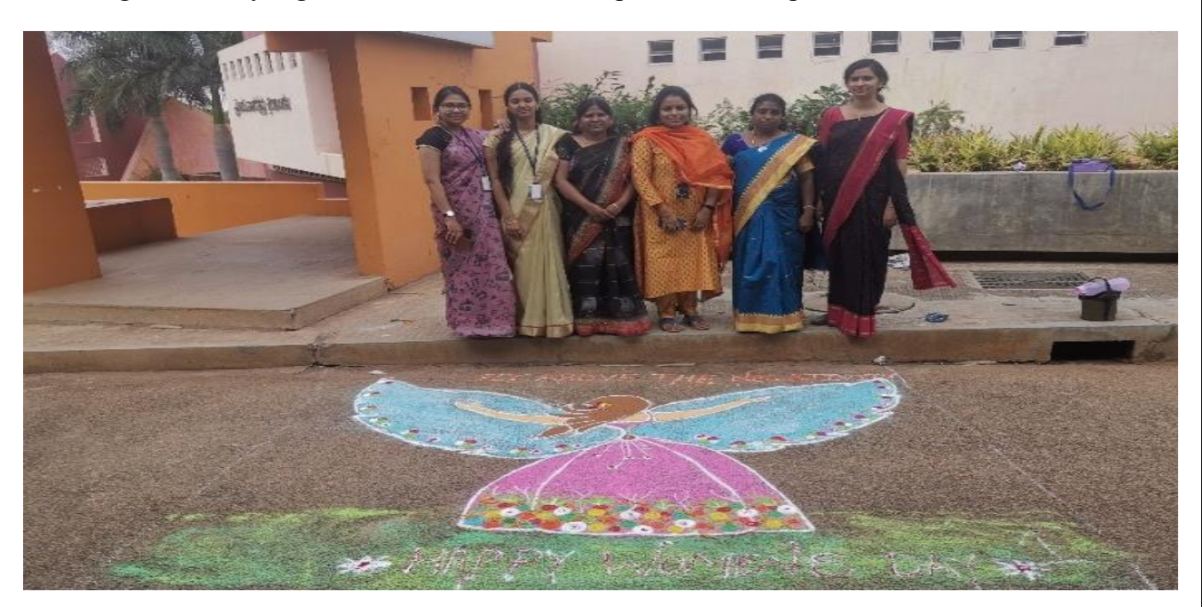
Staff of ABMRCP Celebrating International Women's Day

This event is celebrated on 11<sup>th</sup> March 2018. Women are a valuable part of society, they are the key to preserve the human race and in today's world, the importance of women in society is beyond any suspicion. However, to celebrate the social, economic and cultural achievements of women in various walks of life every year Women's Day is celebrated across the world Women are increasingly being recognized as more vulnerable to climate change impacts than men, as they constitute the majority of the world's poor and are more dependent on the natural resources which climate change threatens the most. At the same time, women and girls are effective and powerful leaders and change-makers for climate adaptation and mitigation. They are involved in sustainability initiatives around the world, and their participation and leadership results in more effective climate action. International Women's Day (March 8) is a global day celebrating the historical, cultural, and political achievements of women. have magnanimously organized blood donation camp in ABMRCP premises.