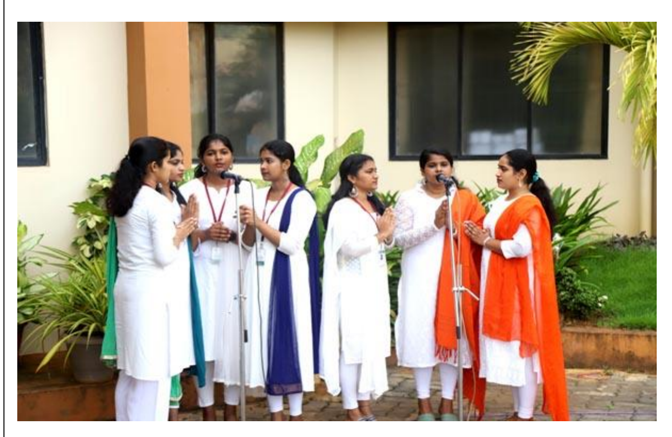
ABMRCP Students Participation in Republic Day

The teachers of the school have prepared a handbook for the students and will arrange in the fifth. This is a special day to get together and celebrate the Republic Day. On the occasion of 70th Indian Republic Day Celebration, this event will witness an array of cultural performances on 26<sup>th</sup> January 2019. This year's program will feature eminent artists from different parts of India. The participants are guided by experienced professionals and are available for public. The event is organised in collaboration with Deccan College Post Graduation Admission Test (ICAT) and has been designed to provide a platform for all aspiring participants to celebrate the Day with a sense of pride and accomplishment.