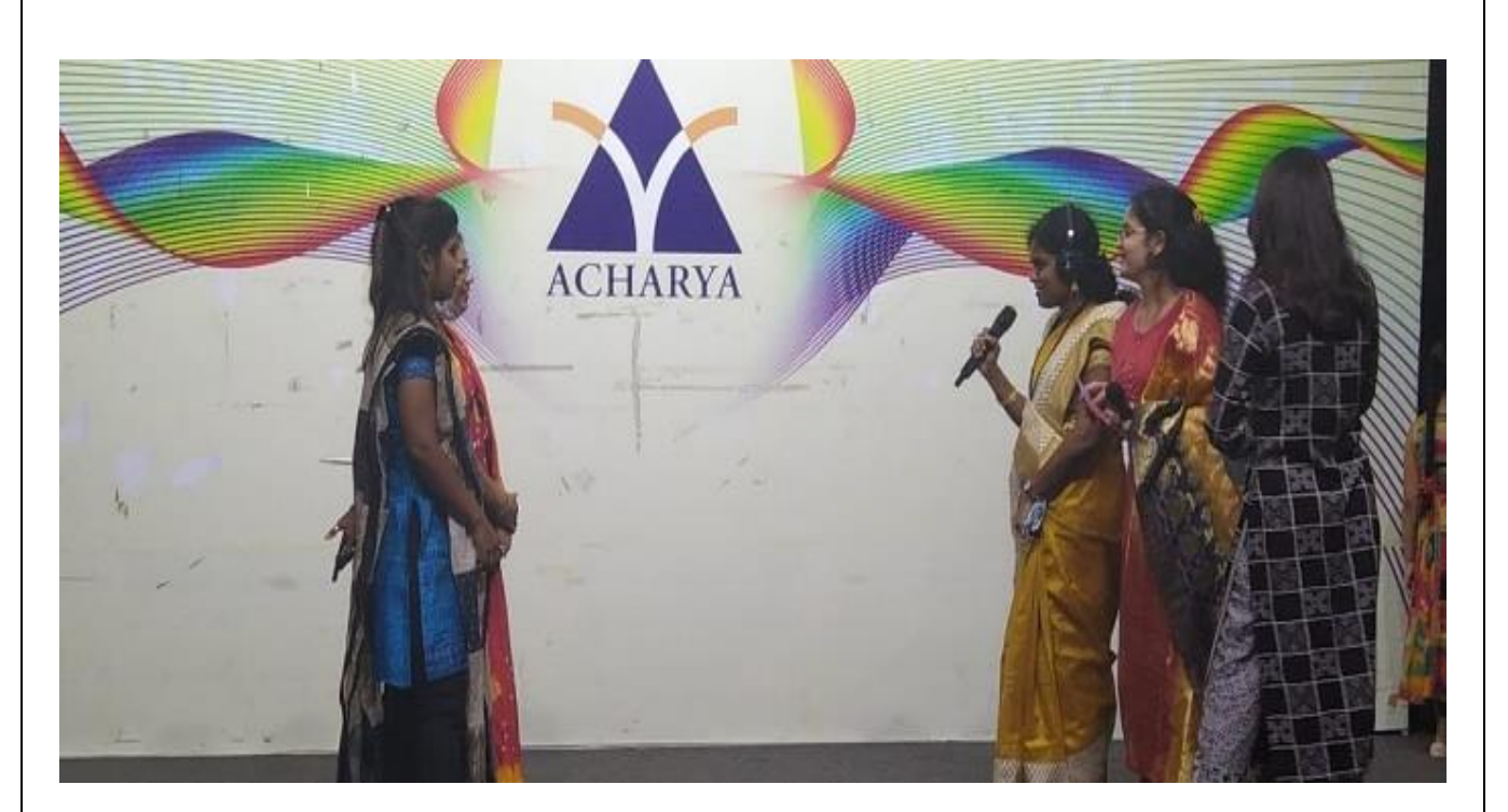
Teachers of ABMRCP Celebrating International Women's Day

The events were organized on the 5th of March 2022. Women are a valuable part of society, they are the key to preserve the human race. International Women's Day (March 8) is a global day celebrating the historical, cultural, and political achievements of women. The day also observed in support of taking action against gender inequality around the world. In the early 1900s, women were experiencing pay inequality, a lack of voting rights, and they were being overworked. In response to all of this, 15,000 women marched through New York City in 1908 to demand their rights. An International Women's Conference was organized in August 1910 by Clara Zetkin, who proposed a special Women's Day to be organized annually. On August 18, 1920, the 19th Amendment was ratified and white women were granted the right to vote in the U.S. When the internet became more common place, feminism and the fight against gender inequality experienced a resurgence. Women's Cell, ABMRCP celebrated the IWD 2022 on a large scale with various activities for all the students and women employees.