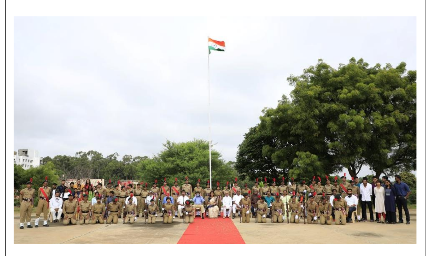
Flag Hoisting by Staff of ABMRCP on 74th Independence Day

The Independence Day of India commemorated on August 15th 2020, which corresponds to the date when India became an independent republic. Even though this date was not announced by any civil or religious body but yet it holds a great importance for the people of India. The event is celebrated every year by people across the subcontinent after independence from colonial rule. Indian Independence Day 2020 marked by the celebration of 70 years of freedom for India. This day is celebrated as 'Seva Dhyanva' in India and is also known as Raksha Bandhan, to express love, affection, respect and gratitude towards women. India's Independence Day 2020, also known as Vijay Diwas and Republic Day (Republic) of India, is a national holiday celebrating the anniversary of Indian independence from colonial rule on 15 August 1947.