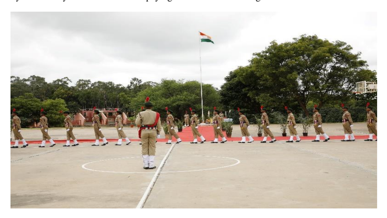
Students Marching on 71st Independence Day

Indian Independence Day is a national holiday celebrated on 15 August every year. It commemorates the independence of India on 15 August 1947 from the British rule. 'Independence Day' is a national holiday in India to commemorate the independence of the nation. It is a public holiday in India with observances held throughout the country. Independence Day celebrations in India is celebrated throughout the country on 15 August every year as per Indian calendar. Independence Day may be a non-political event, but it is also a time to celebrate the spirit of our freedom movement and the values it stands for. The strength of India's democracy lies in our people, and on 15th August this year, we will once again come together as one country to commemorate this historic achievement. On this Independence Day 2017, we wish to honour Indian freedom fighters who fought against the British and struggled to achieve freedom. To celebrate the birth of our country we are highlighting how important it is for every Indian to celebrate this special day by singing the National Anthem and lighting up their national flag. Indian Independence Day is celebrated every year on 15th August, by spending the day with family and loved ones and paying tributes to freedom fighters.