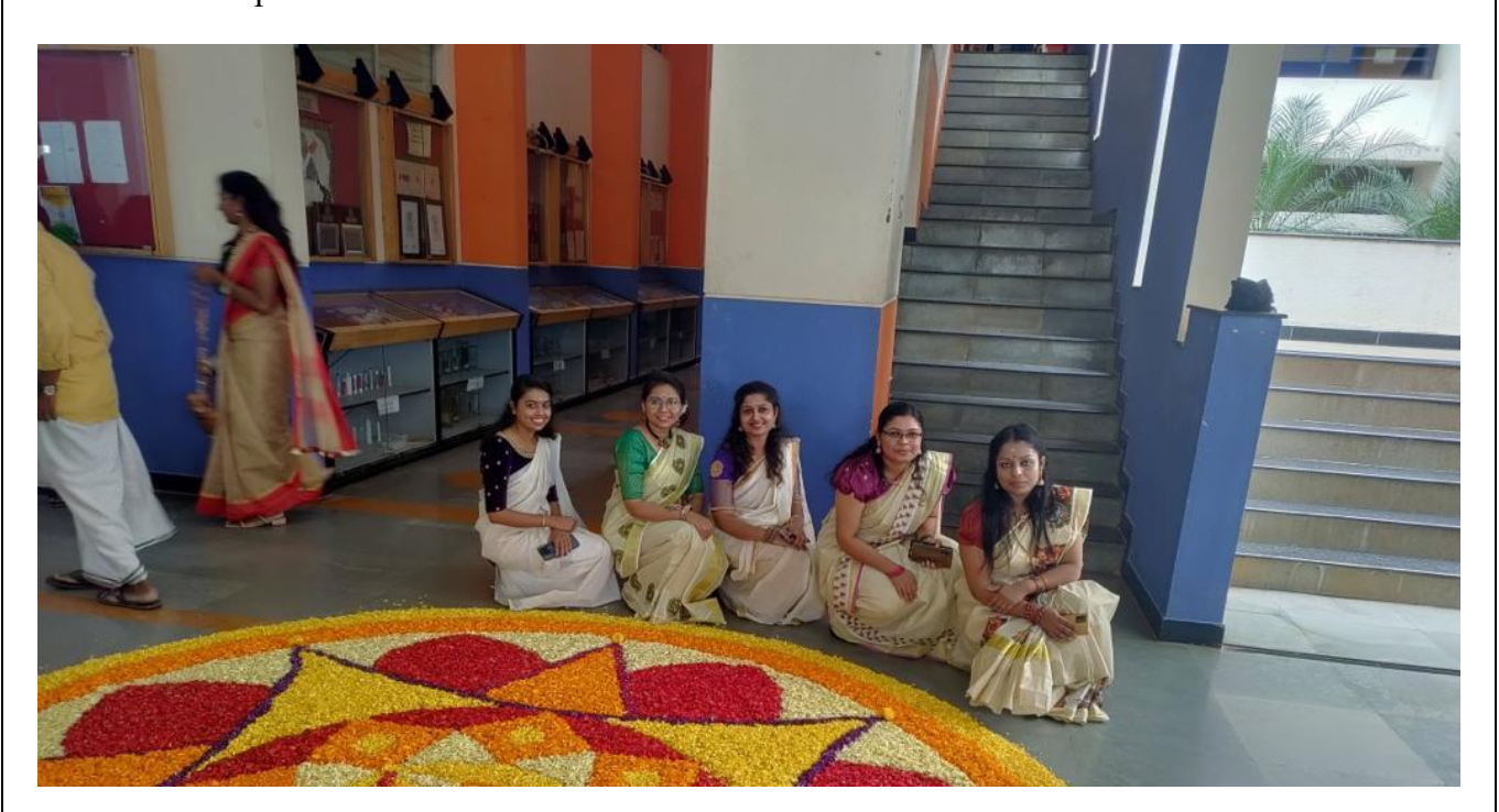
ABMRCP Staff and Students Celebrating Onam Festival

Onam is celebrated on 2<sup>nd</sup> September 2017. Onam is reminiscent of Kerala's agrarian past, and is considered to be a harvest festival. Onam is celebrated to mark the homecoming of the King Mahabali who is believed to be the greatest king ever in Kerala. The preparations of onam celebration was started from evening with students gathering together for drawing the layout of pookkalam (flower carpet) and preparing different colors of flowers by removing petals to be used on next day. Traditional decorations were also arranged by the students as part of the festival. Onam was celebrated in a grand and traditional manner. On early morning of 10th of September 2019, students gathered and prepared the pookkalam in the corridor on the ground floor of ABMRCP. Female Staffs and students came in their traditional sarees and young men resplendent in their colourful choices of dhothis. The keralites students delivered the message on onam and narrated the story of Mahabali (the benevolent and generous king who ruled his kingdom without discrimination) along with visual demo of the story, followed by a procession leading to the volleyball court where various events and competitions were conducted. competition etc were conducted.