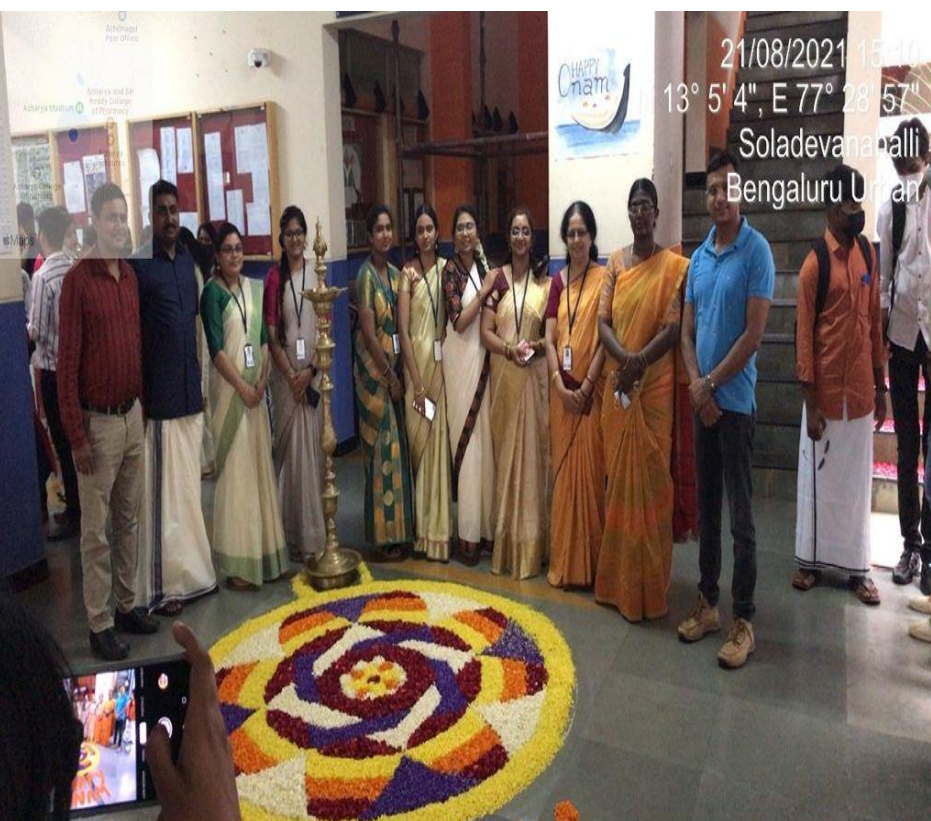
Students and Staff Celebrating Onam Festival at ABMRCP