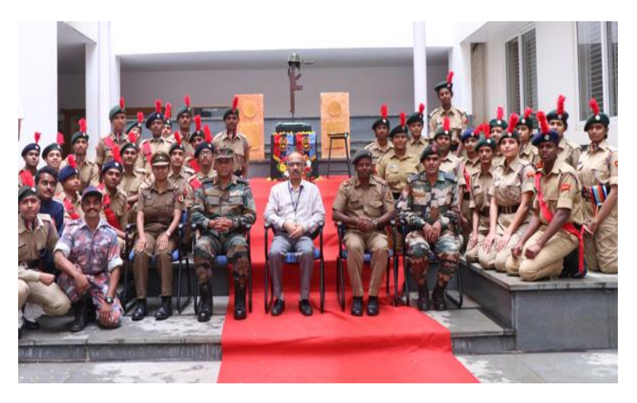
Staff and Students Participation in Independence Day Celebration

Indians celebrated their Independence Day on 15th August 2018. The whole nation celebrates this festival with great enthusiasm and zeal. India's Independence Day is celebrated on 15th august every year. it is a celebration of the freedom from British rule in 1947. The phrase "Independence Day" was adopted by Congress Party to mark the occasion of India's independence from the British Raj. We wish the nation of India and the people to celebrate their Independence Day with all pomp and grandeur. We are looking forward to celebrating this great milestone on 15th August in a big way. The Day 2018 is the most celebrated day in India. It commemorates the Independence of India from the British rule.